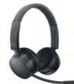
Dell Pro Wireless Headset - WL5022

Elevate your video conferencing experience with this high quality 4K webcam that optimizes your visuals with a large 4K Sony STARVIS™ CMOS sensor and AI Auto-Framing.