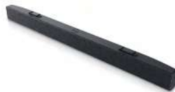
Dell Slim Soundbar - SB521A

An immersive 34" WQHD curved monitor with wide color coverage and extensive connectivity including RJ45, USB-C® and quick-access front ports.